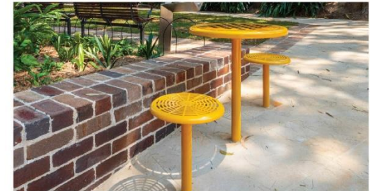
Example of colourful 'cafe style' table and stools