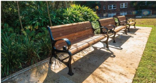
Example of 'traditional style' seating