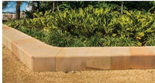
Example of new sawn cut sandstone seating wall